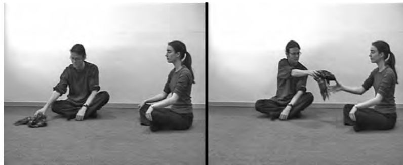
Figure 20.3 Man moves scarf to woman

the floor in front of him. We analyze these verb productions as spatial verbs, since they conform to those produced by the same signers in response to action clips in which an object is moving through space with no transfer involved (figure 20.4).