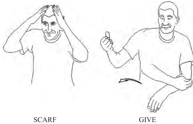
Figure 20.4 ‘There’s a scarf; he handed (it) over (to her) (left to right).’