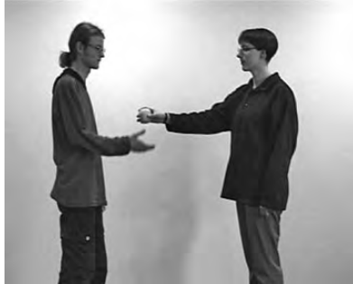
Figure 20.1 Woman gives ball to man

intransitive verbs across different semantic categories. From these we identified a subset of 11 as involving actions of transfer between 2 entities: GIVE , THROW , CATCH , TAKE , and FEED . We then analyzed a group of 9 signers' responses to these 11 elicitation clips, resulting in a total of 110 transfer forms produced by second-generation ABSL signers (which include repetitions and descriptions of single events with two clauses). 5