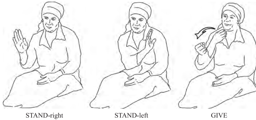
Figure 20.2 ‘He’s standing here; she’s standing there. She gave (the ball) to him.’