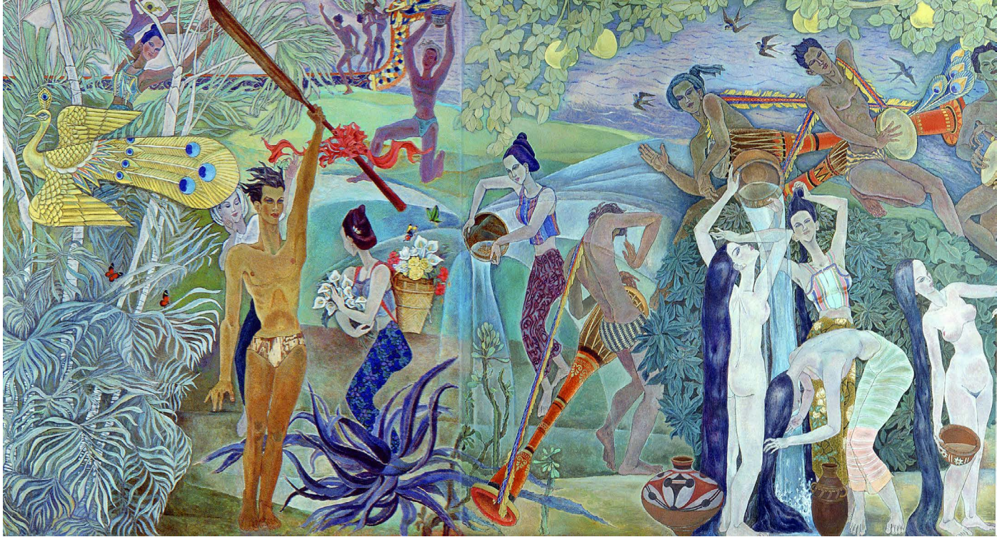
Yuan Yunsheng, Water-Sprinkling Festival: An Ode to Life (detail), acrylic, mural, Beijing International Airport Terminal II, 1979. Courtesy of the artist.

In 1956, a young student from Beijing’s Central Academy of Fine Arts attended an oil painting and print exhibition held by the Mexican National Front of Plastic Arts. He also personally listened to David Alfaro Siqueiros’s impassioned speech. This experience marked a turning point in the life and artistic career of Yuan Yunsheng. Over the following half-century, he not only created significant works of contemporary mural art but also devoted his life to reviving Chinese national culture and spirit, with the aim of reconstructing a culturally sovereign contemporary art education system in China.