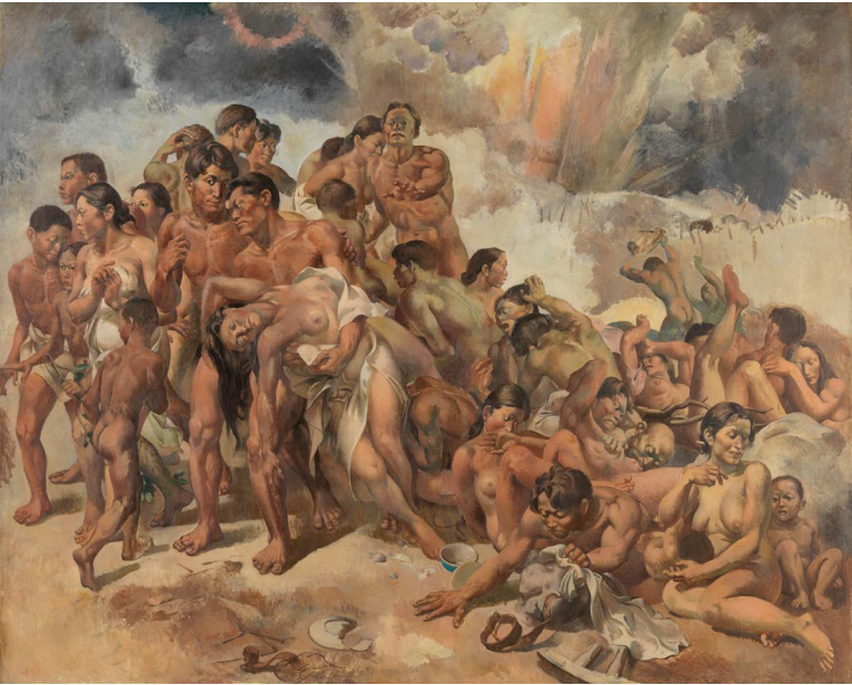
Lee Qoede, People IV , 1948. Oil on canvas, 70 × 85 in. (177 x 216 cm). © Courtesy of the Lee Qoede Estate.

This presentation explores the overlooked transnational connection between Korean modern painter Lee Qoede (1913–1965) and the Mexican mural movement. While Lee is often discussed in the context of Korean art history and Cold War politics, his engagement with socially driven art and admiration for Mexican muralists—particularly Diego Rivera—has been largely ignored. Drawing from archival interviews and visual analysis, this talk repositions Lee not only as a nationalist painter but as a globally conscious artist shaped by international currents of revolution and resistance. It calls for a reevaluation of his work through the lens of transpacific artistic dialogue and solidarity.