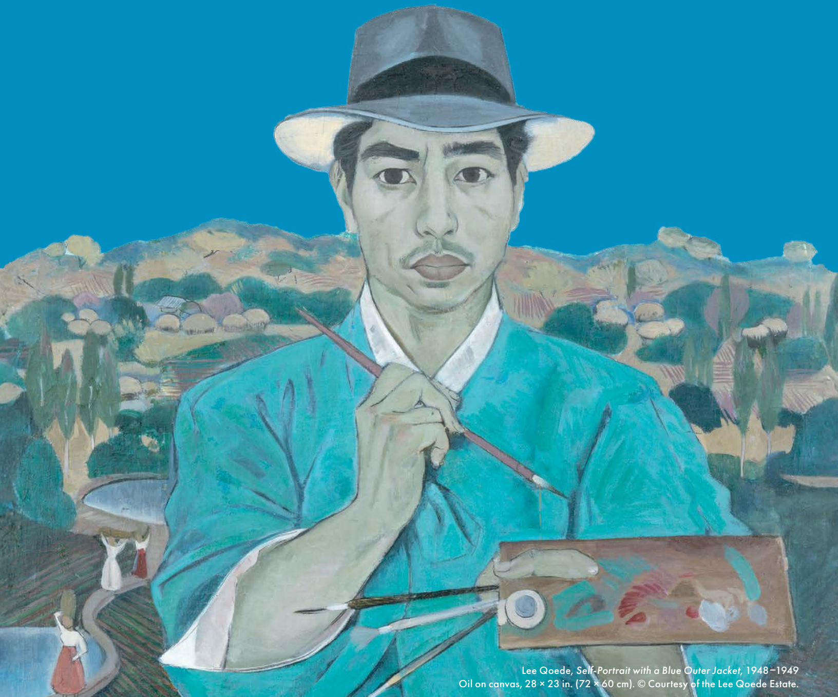
Lee Qoede, Self-Portrait with a Blue Outer Jacket , 1948–1949 Oil on canvas, 28 × 23 in. (72 × 60 cm). © Courtesy of the Lee Qoede Estate.