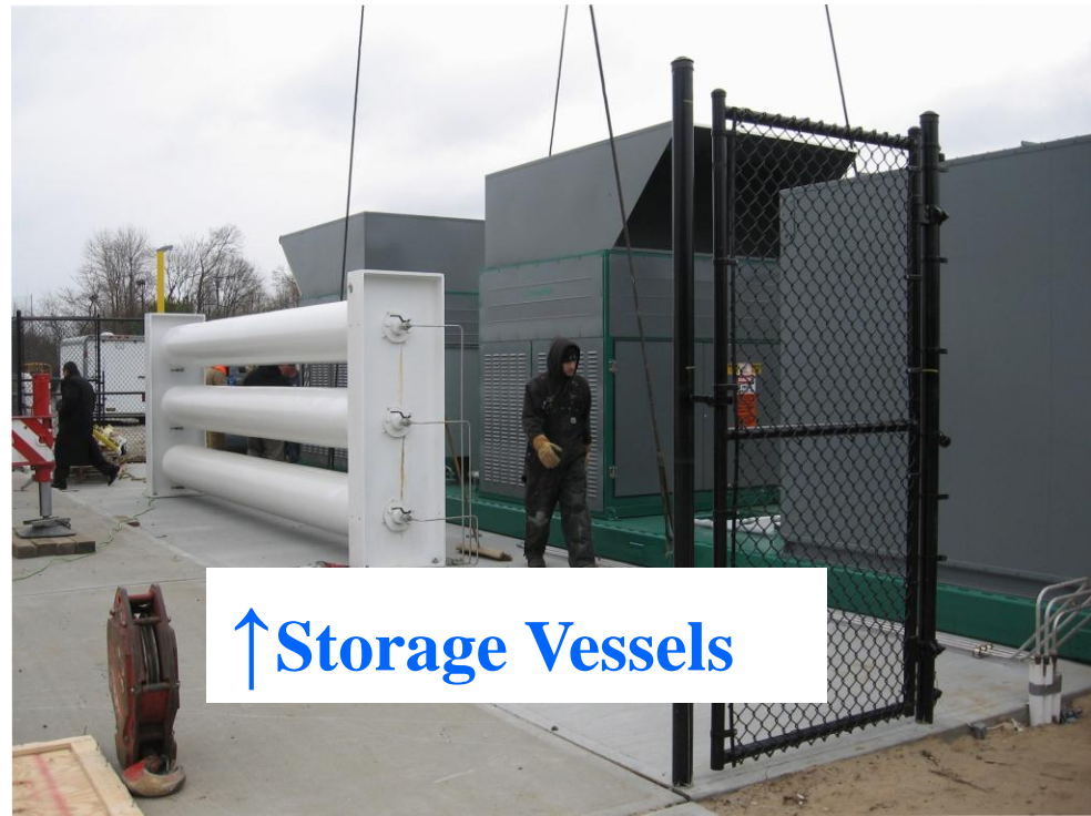
↑ Storage Vessels