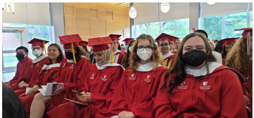
MA in Political Science graduates.