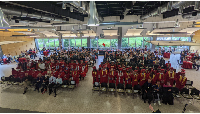
Political Science Class of 2022 and guests