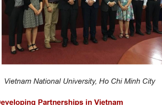
Vietnam National University, Ho Chi Minh City