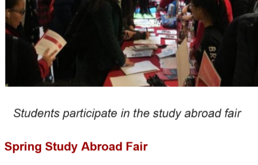
Students participate in the study abroad fair