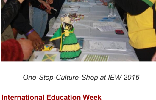
One-Stop-Culture-Shop at IEW 2016