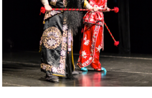
Peking Opera at Confucius Institute Day