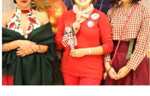
IEC Halloween Party

This semester, the Global Forum continues with three exciting events on contemporary global issues impacting our campus!