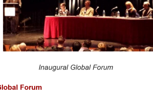
Inaugural Global Forum