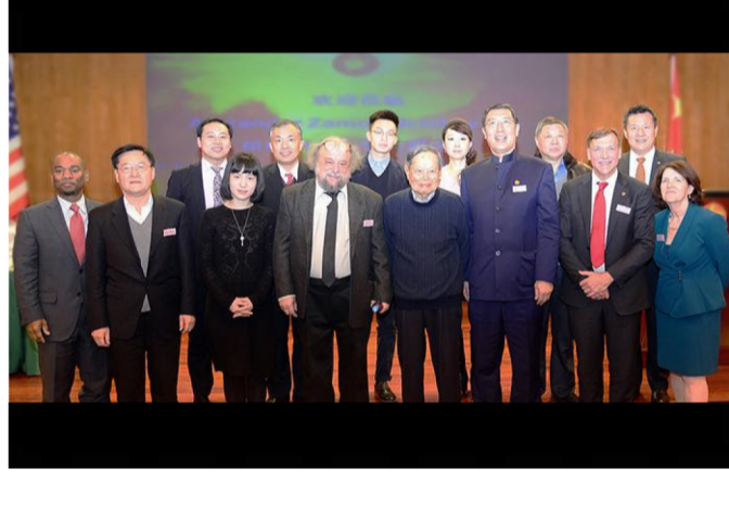
Picture: Investiture ceremony of the C.N. Yang - Wei Deng Endowed Chair in Physics & Astronomy in Beijing

A pioneer in modern theoretical physics and member of the National Academy of Sciences, Dr. Zamolodchikov is known internationally for his contributions to the study of condensed matter physics, conformal field theory and string theory.