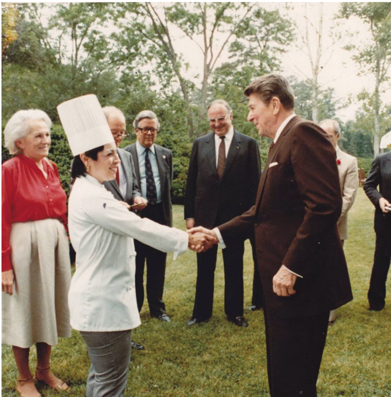
Figure 3. Martinez meeting President Ronald Reagan at the May 1983 Williamsburg economic summit. Box 7, Folder 2, Zarela Martinez Papers.