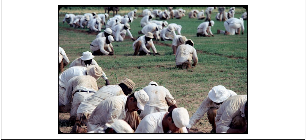
Figure 3. Mexican American prisoners planting cotton seeds in field, Ellis prison-1978.