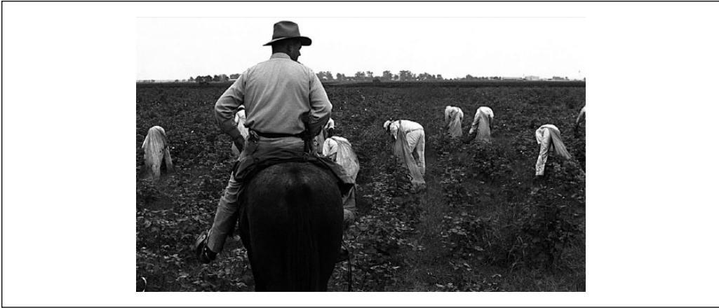
Figure 2. Prisoners picking cotton as prison guard “highrider” oversees prison field labor, 1965 Ramsey prison