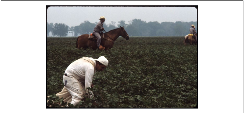
Figure 4. Mexican American prisoner picking cotton, Ellis prison-1978, courtesy of Bruce Jackson.

short lived work strikes at least twice during the late 1950s and early 1960s. In both strikes, these prisoners demanded a five-day prison labor workweek rather than the typical ten-hour workday with a six-day work schedule. While the prison administration put down both of these strikes after only one day, Harlem farm maintained a tradition of prisoner resistance among Mexican American prisoners who drew upon labor protest practices. These work strikes were uncoordinated, lacked leadership, and were relatively rare, but given the totality of the work regime these brief moments of collective resistance among Mexican American prisoners suggest a deep undercurrent of discontent. 39