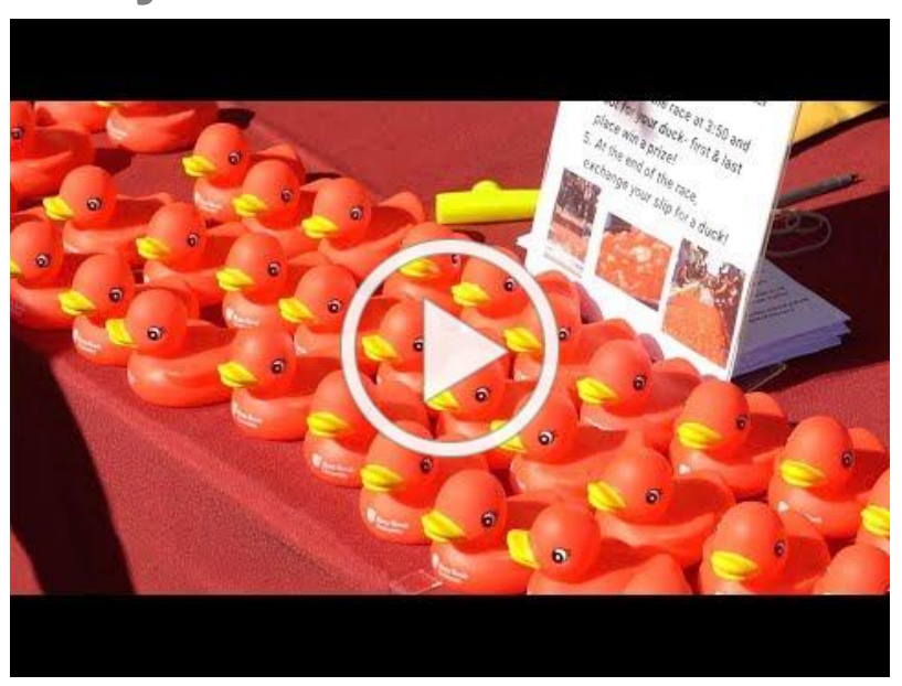
CommUniversity Day 2019

More than 4,000 members of the community enjoyed a beautiful day full of fun, learning and discovery at CommUniversity Day on September 21, 2019. The free festival, now in its third year, showcased the best of the University and Hospital through more than 100 interactive, handson activities and performances coordinated by more than 350 student and employee volunteers.