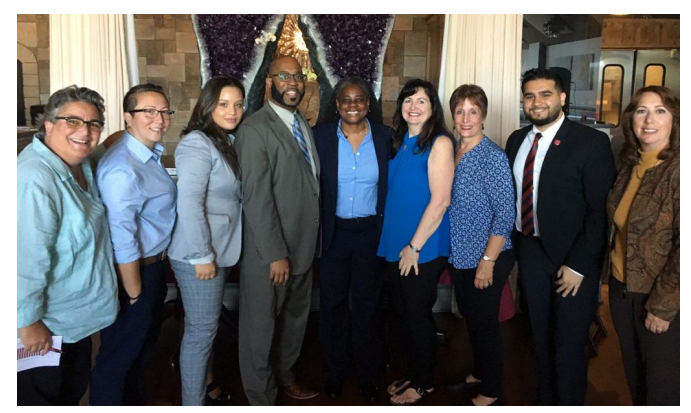
Elected officials, Greater Port Jefferson Chamber of Commerce leadership, and SBU faculty and staff team up to raise cultural awareness in the Business Community.

In an effort to help merchants to expand their cultural awareness, the <u>Greater Port Jefferson Chamber of Commerce</u> partnered with <u>Stony</u> Brook University's Office of Community