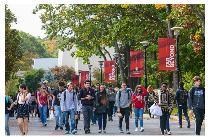
Stony Brook University Campus

Stony Brook University has been ranked No. 80 among U.S. colleges and universities by <u>U.S.</u> <u>News & World Report</u>, the highest ranking in the university's history and up 17 places from No. 97 last year. Among public universities nationally, Stony Brook University ranks No. 32.