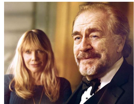
The Etruscan Smile with Brian Cox and Rosanna Arquette.