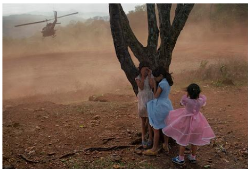
James Nachtwey, "El Salvador," 1984

Presented in conjunction with the Stony Brook Film Festival, "Faces and Places" photographs from the Kellerman Family" features more than 60 color and black-and-white photographs by well-known documentary and fine art photographers. The exhibition opens Thursday, July 19, at the Paul W. Zuccaire Gallery, located on the first floor of Staller Center, with a reception the following evening, Friday, July 20, from 5 pm to 7 pm.