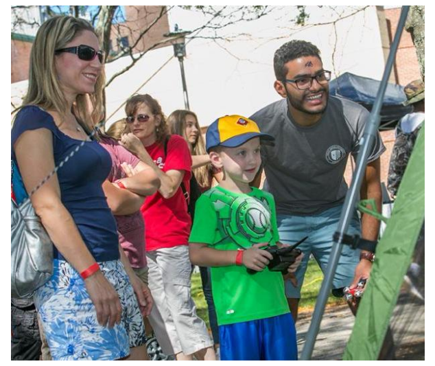
Family fun was had by all at Stony Brook's first CommUniversity Day in September.

New Nursing PhD Program Answers Need for More Nurse-Scientists