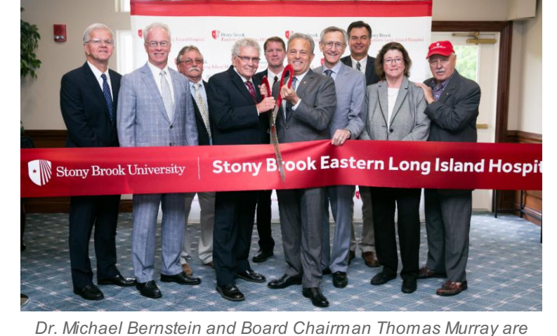
joined by SBELIH leadership and local elected officials.

devoting many years to seeing the partnership formed.